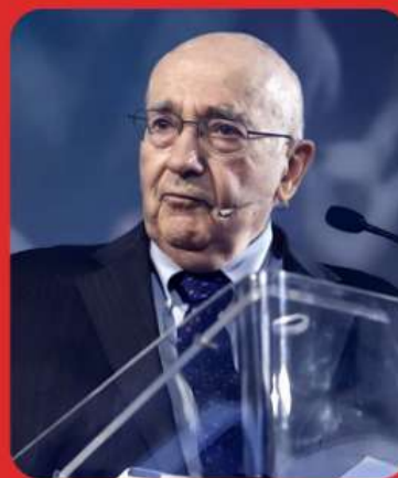
Dr. Philip Kotler Father of Modern Marketing