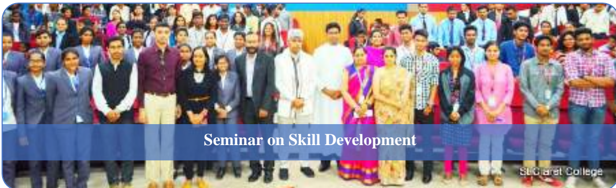
Seminar on Skill Development