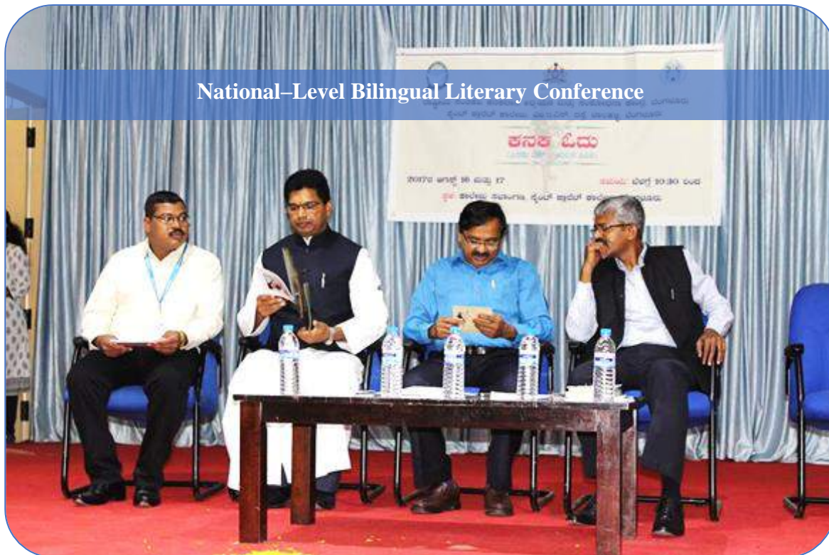
National-Level Bilingual Literary Conference