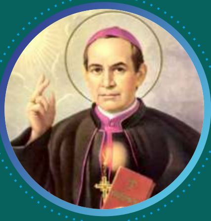
St. Anthony Mary Claret Our Patron