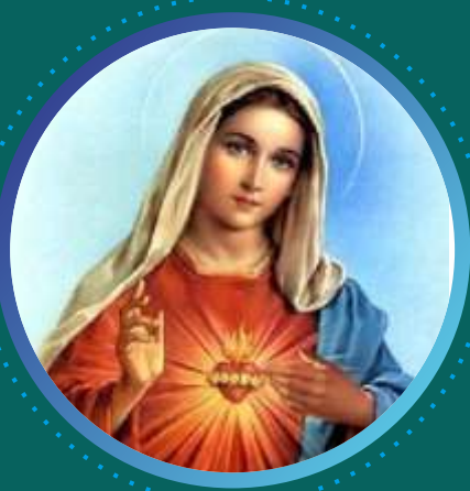
Blessed Virgin Mary Our Inspiration