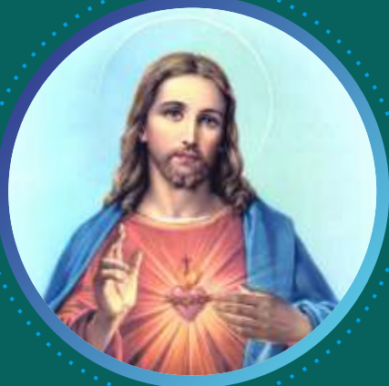
Jesus Christ Our Foundation