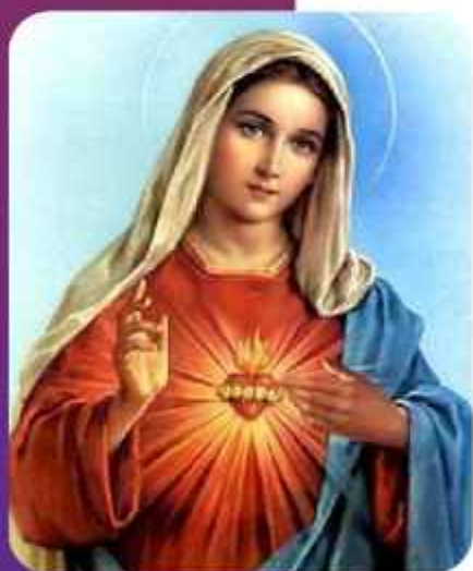
Blessed Virgin Mary