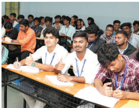
Chart Your Path: Career Goals Masterclass (9th August 2024)

Embarking on the academic journey, the Bridge Course set the foundation for our I BBA students, equipping them with essential business acumen and fostering a seamless transition into their program. Under the guidance of our department faculty, students gained insights into management principles, communication skills, and industry expectations. The three-day program served as a gateway to holistic learning, inspiring students to navigate their business aspirations with confidence.